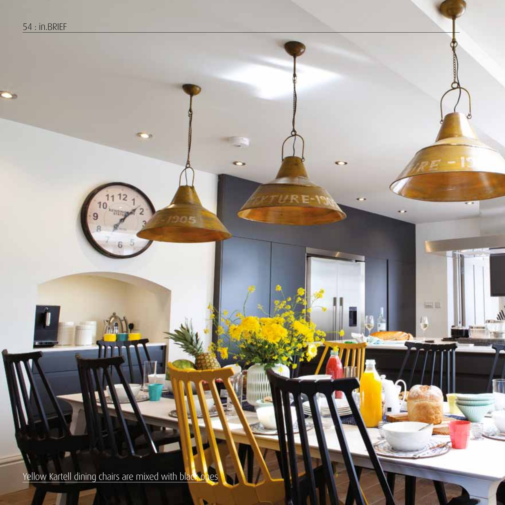
Yellow Kartell dining chairs are mixed with black ones