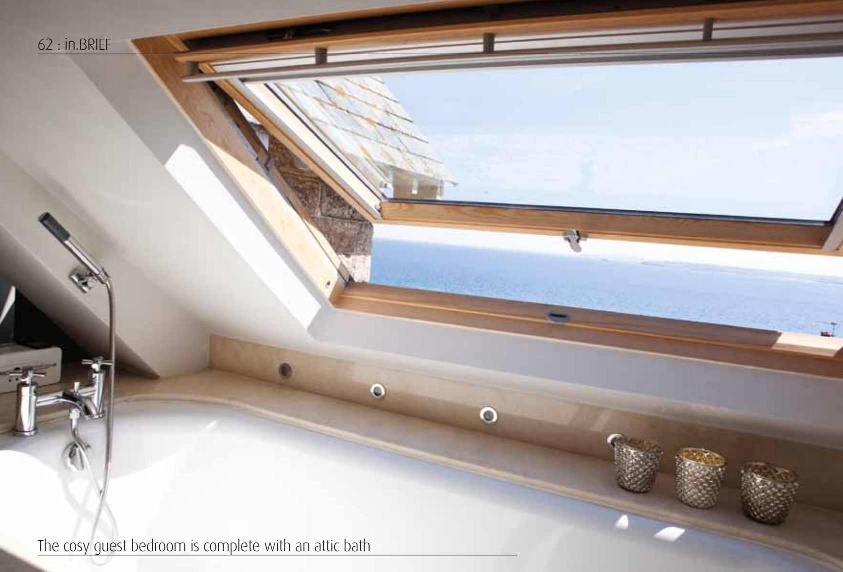
The cosy guest bedroom is complete with an attic bath