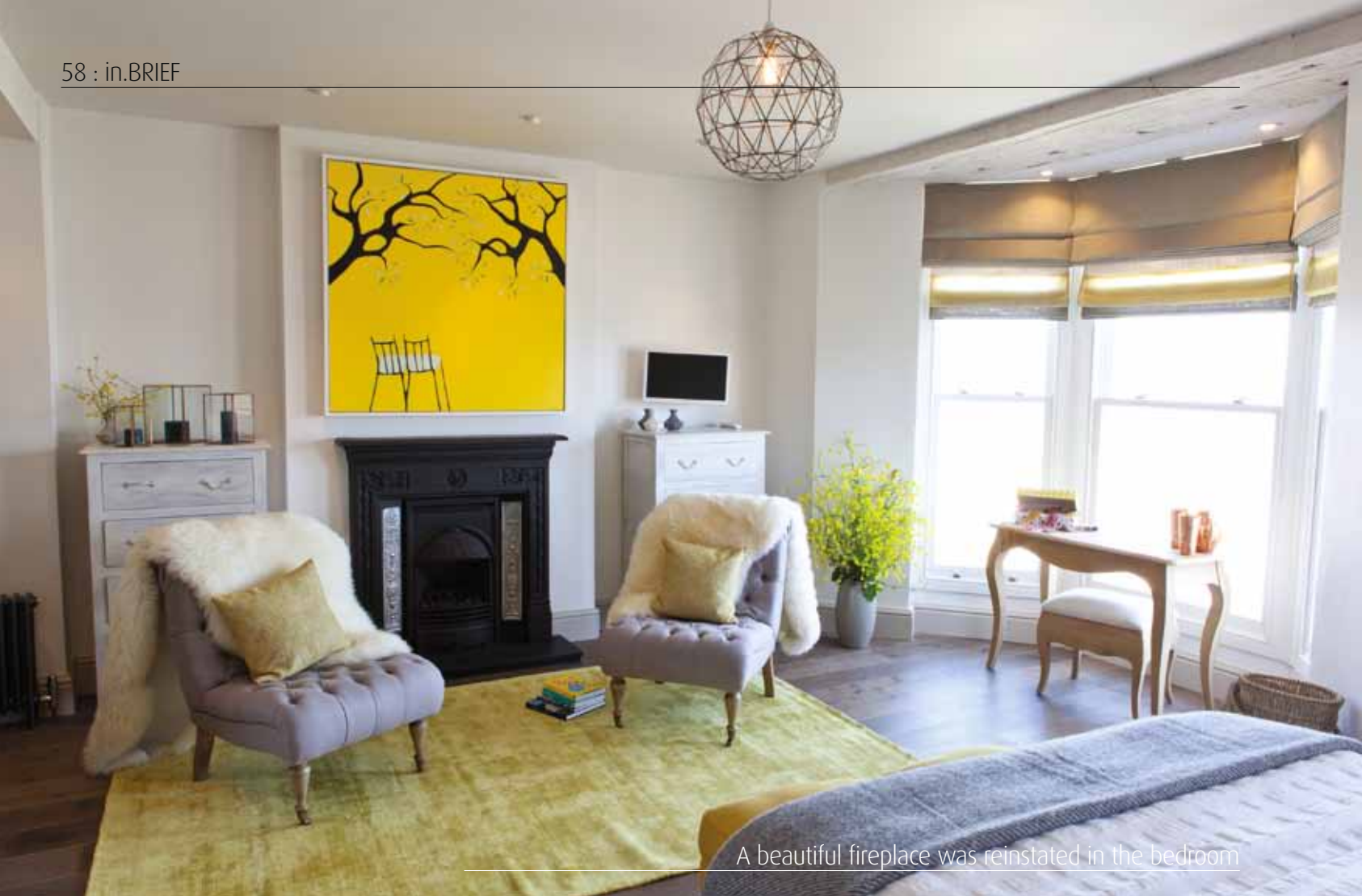
A beautiful fireplace was reinstated in the bedroom

▲ Harveys and combined their gentle shapes and lines with muted Zoffany wallpapers and complementary yellow and grey accessories throughout the property – allowing a holistic sense of consistency and order to be juxtaposed with bringing classic-cool back to Cornwall.