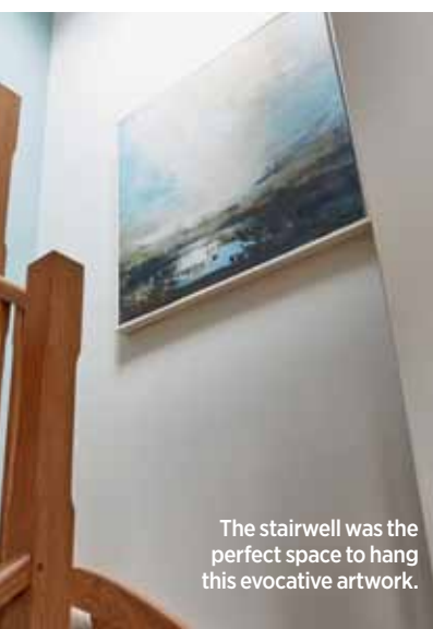
The stairwell was the perfect space to hang this evocative artwork.

We used a variety of luxurious textures and fabrics from Mark Alexander, Larsen and Cole and Fowler alongside Zoffany paints. The result was a beautiful, private home layered with colour that incorporates the panoramic vistas into every room, creating the perfect escape. One immediately feels refreshed and relaxed in this home. The clients visited once everything was completed and they were thrilled with the results, as it was a total transformation from their previous visit of bare studwork! ♦ camelliainteriors.co.uk