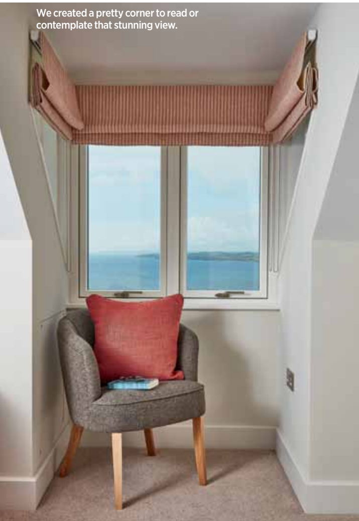
We created a pretty corner to read or contemplate that stunning view.

Making the most of the interiors is vital in helping to frame those all important coastal views - as this house on the Roseland Peninsula designed by Camellia Interiors perfectly demonstrates