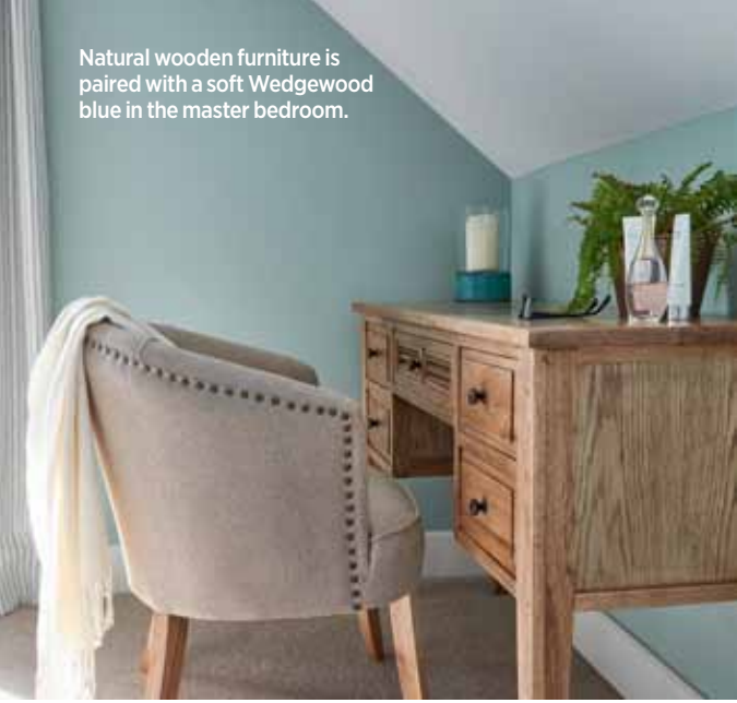
Natural wooden furniture is paired with a soft Wedgewood blue in the master bedroom.