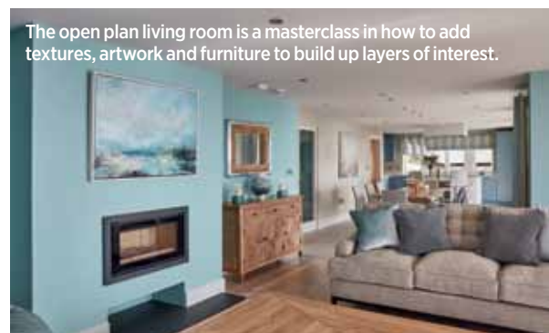
The open plan living room is a masterclass in how to add textures, artwork and furniture to build up layers of interest.