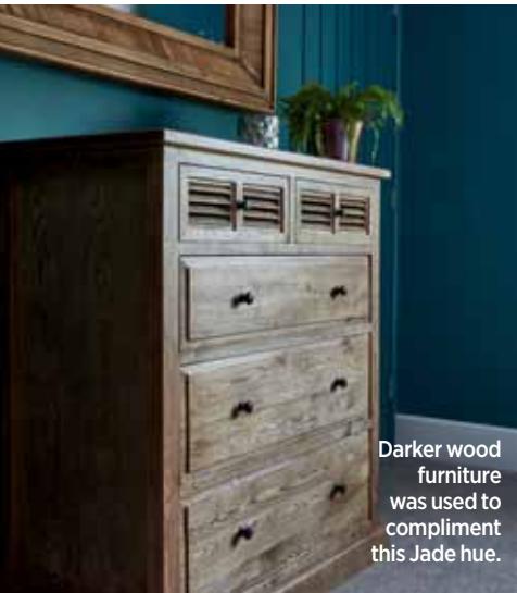
Darker wood furniture was used to compliment this Jade hue.