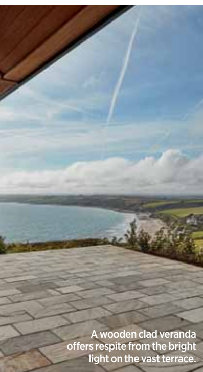
A wooden clad veranda offers respite from the bright light on the vast terrace.