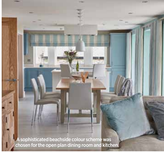
A sophisticated beachside colour scheme was chosen for the open plan dining room and kitchen.