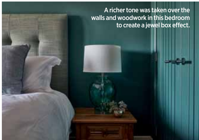
A richer tone was taken over the walls and woodwork in this bedroom to create a jewel box effect.